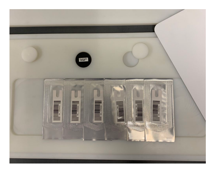
FIGURE 2: B3 dosimeters overlapping edges (with alanine dosimeter)