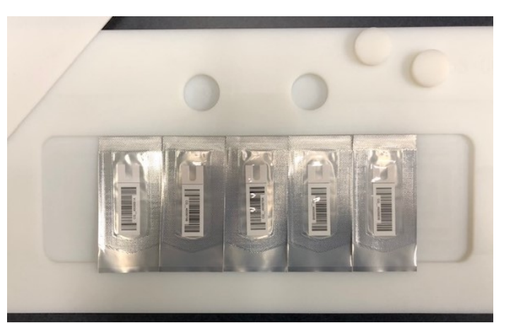
FIGURE 1: B3 dosimeters spaced edge to edge

Place the film dosimeter samples into the large well of the phantom. The pouches may be placed edge to edge or overlapped, but should never cover the dosimeter in the pouch that it overlaps. See Figures 1 and 2.